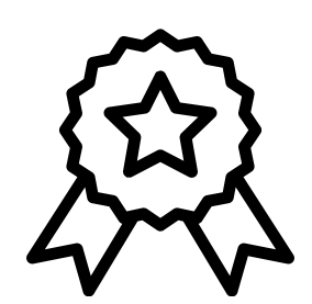
100% PLACEMENT ASSISTANCE