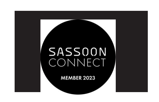
INDIA'S ONLY SASSOON ACADEMY SCHOOL CONNECT