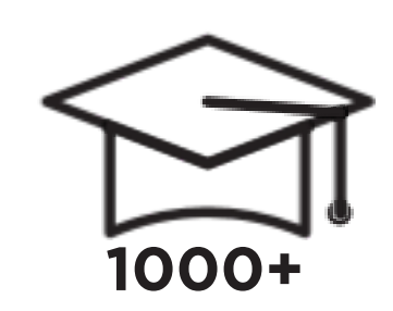
1000+ SUCCESSFUL ALUMNI